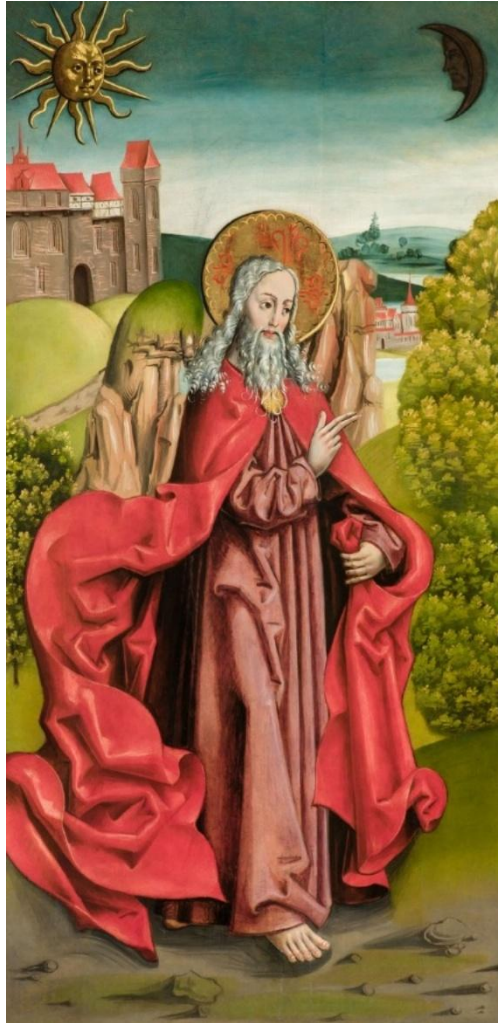
"God the Father Almighty, Creator of Heaven and Earth"