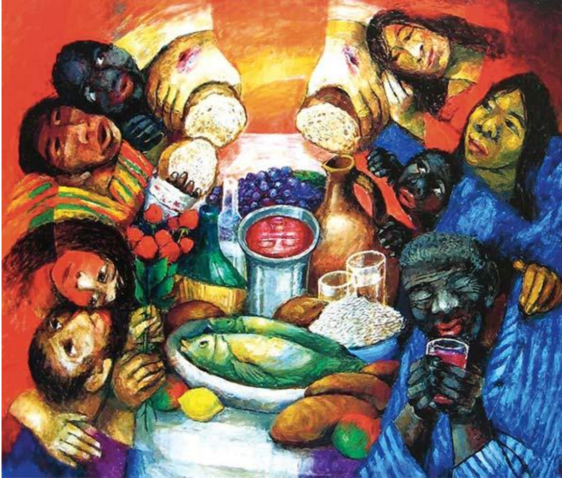
"The Meal" – Sieger Koder