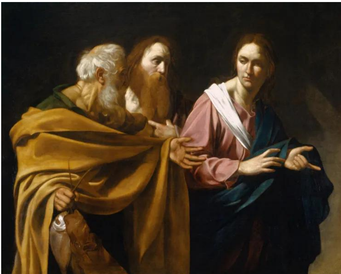
"The Calling of Saints Peter and Andrew" – Caravaggio