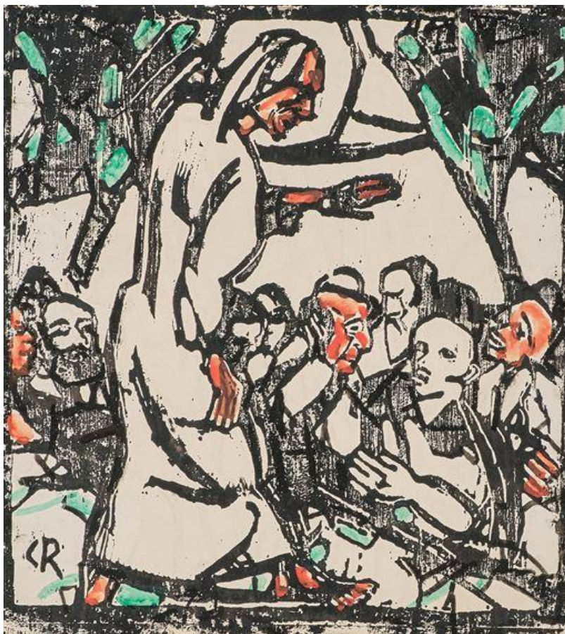
"Sermon on the Mount" – Christian Rohlfs