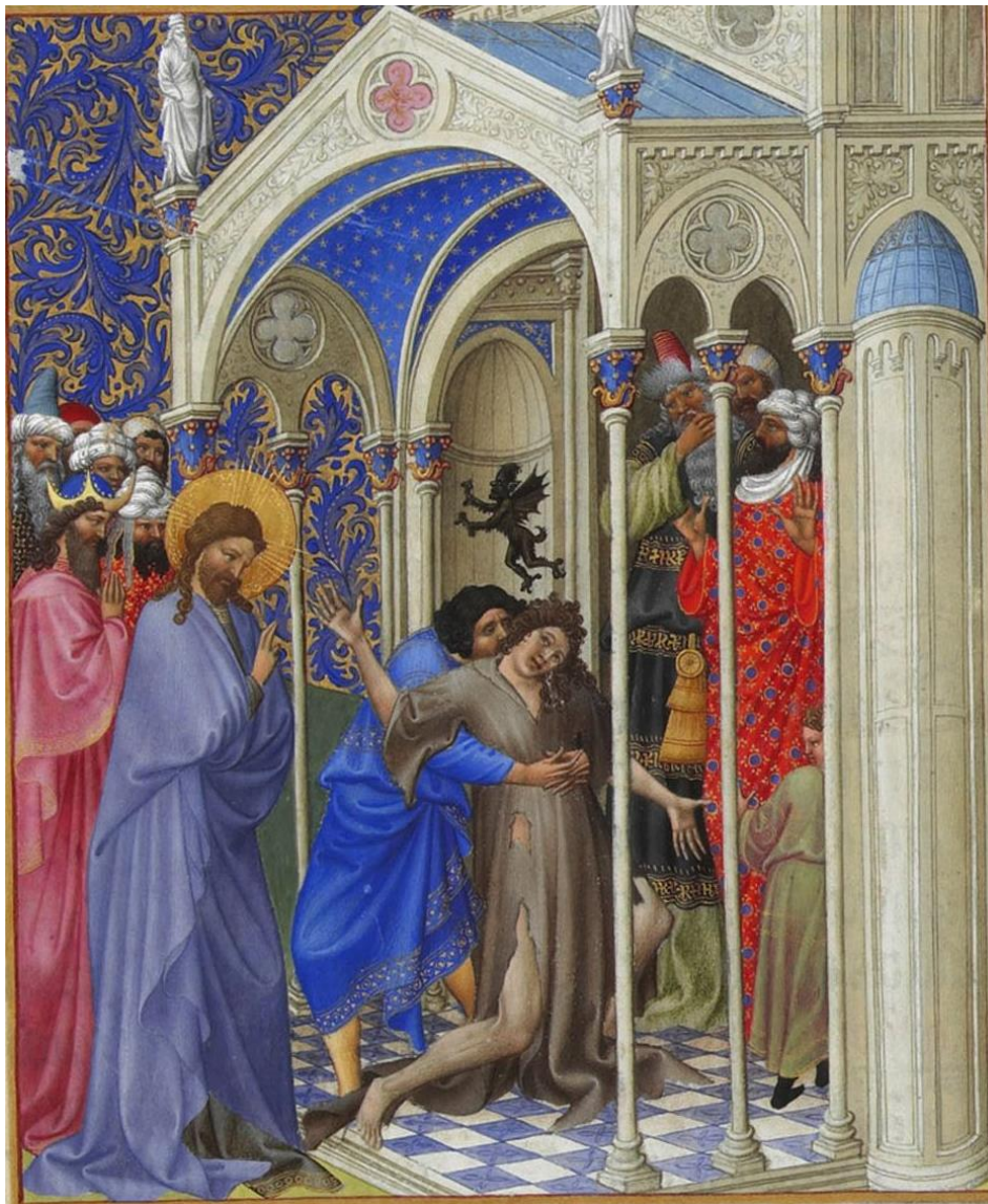
from Très Riches Heures du Duc de Berry