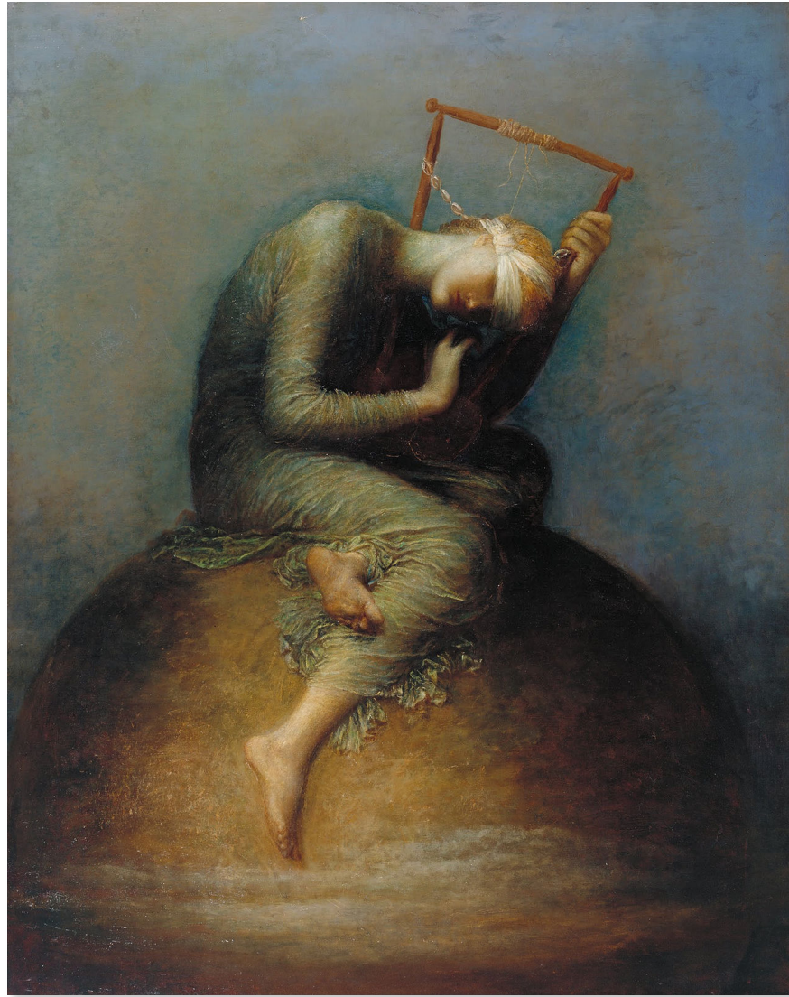
"Hope" — George Frederic Watts