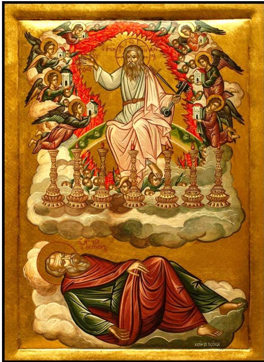
'The Vision of John on Patmos'